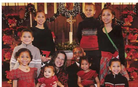
The Dunford Clan at First United Methodist Church, Enid OK during Christmas 2009

Resolve that you won't cross the line. Chances are, the moment you do, you will be tested in some way. And that's what grace is for. Acknowledge mistakes, ask for forgiveness, and set your mind right back on your standard. Over time, you will begin to master resolve for the Master. And like Daniel, your resolve will allow others to see a real God, in real life, in action. Don't compromise!