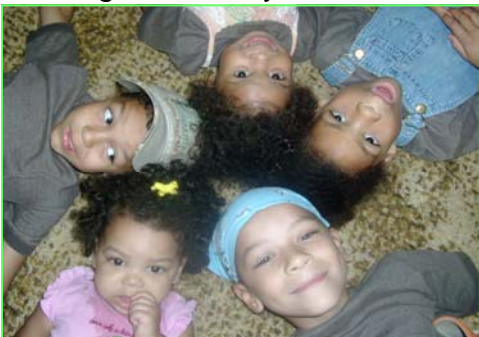
Five Pretty Faces All In Their Places! (The Middles and the Littles)