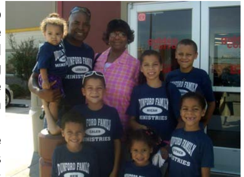
Celebrating Grandma's Birthday!

One of the concerns we had in relocating is not losing connection with our dear friends and faithful spiritual family in Enid and abroad. The Lord has covered that base so very well thus far. About once a month, we have had ministry assignments in Enid area since we have moved. Praise The Lord! And that is largely due to people like you being sensitive to His voice to invite us to share in what He is doing with you and