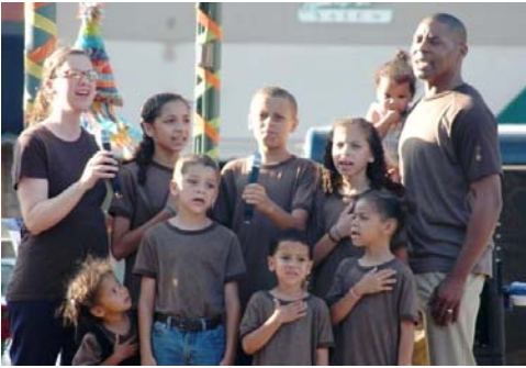
Singing @ Relay For Life in Enid, OK