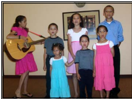
Sharing @ Good Neighbor Assisted Living Center in Weatherford OK

We made a commitment to help our family who farms in the area as often as needed as well as continue ministering whenever and wherever the Lord saw fit. Since we began this ministry in the fall of 2007, God has been faithful to invite us to share in His marvelous work. At the writing of this update, we have been in Custer City about five months and in that time we have been invited to speak at the County Jail, to sing at an assisted living center, and participate in worship at two local congregations. We have also visited several other places of worship with our new friends and neighbors.